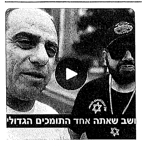
PerspectivesTv פרספקטיבה ישראלי בקנדה facebook.com