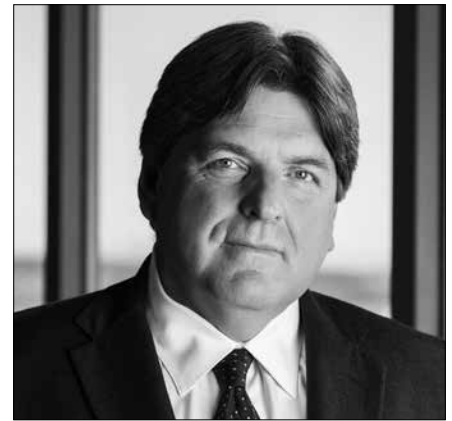
Randall Kaardal KC Hunter Litigation Chambers

WWL says: Murray Campbell is singled out by market sources as a go-to practitioner who is "particularly active in the pensions arena".