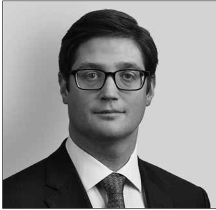
Hugh Meighen Borden Ladner Gervais LLP

333 Bay Street, Suite 900 Toronto, M5H 2R2 Tel: +1 416 670 5693 dharrison@harrisonadr.com www.harrisonadr.com